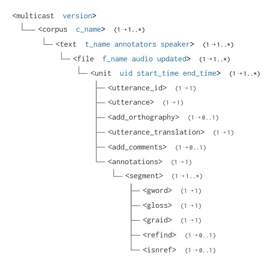
Figure 3 The structure of the Multi-CAST XML files. Attributes are given in blue. Cardinalities: (0..1) 'zero or one', (1) 'exactly one', (1..*) 'one or more'.

romaji). If present, a child of the utterance tier in a one-to-one relation ( symbolic association ).