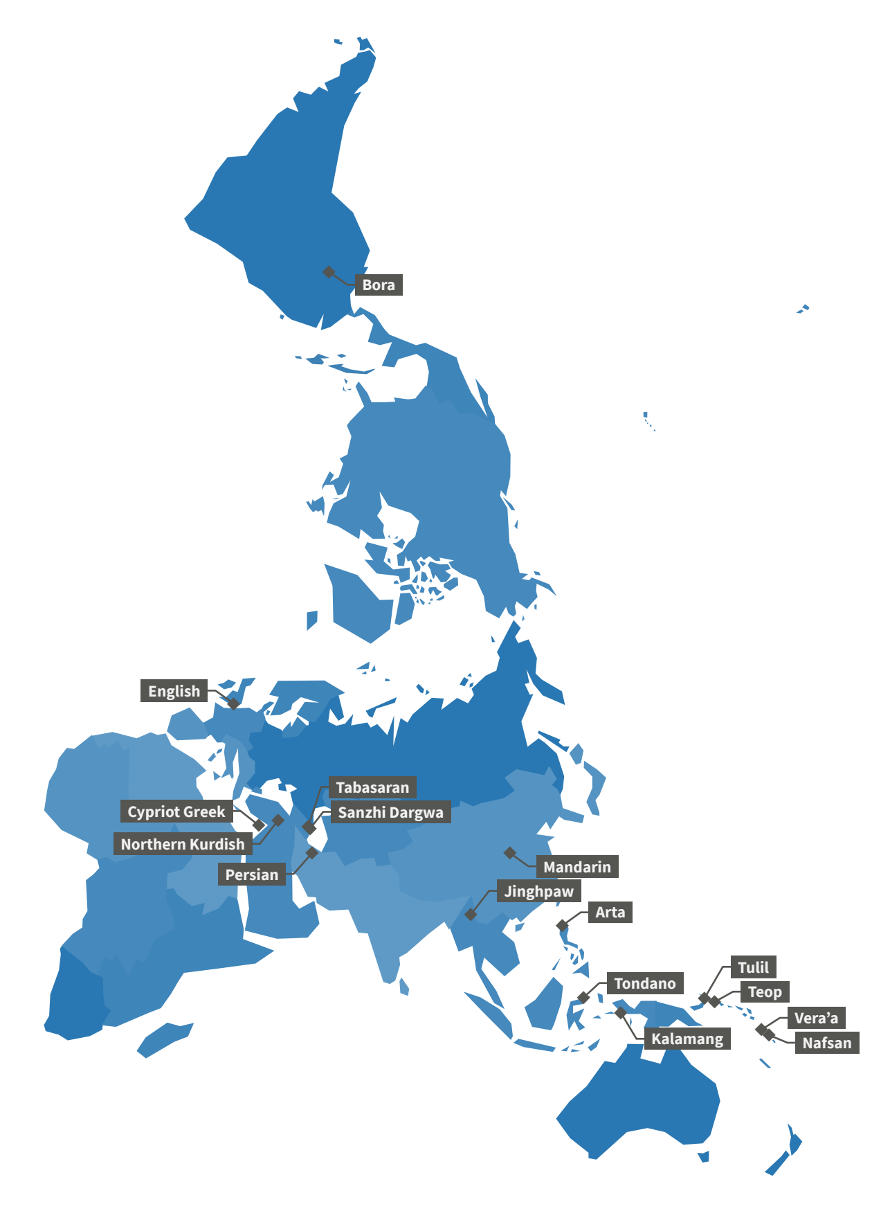
Figure 1 The Multi-CAST corpora.