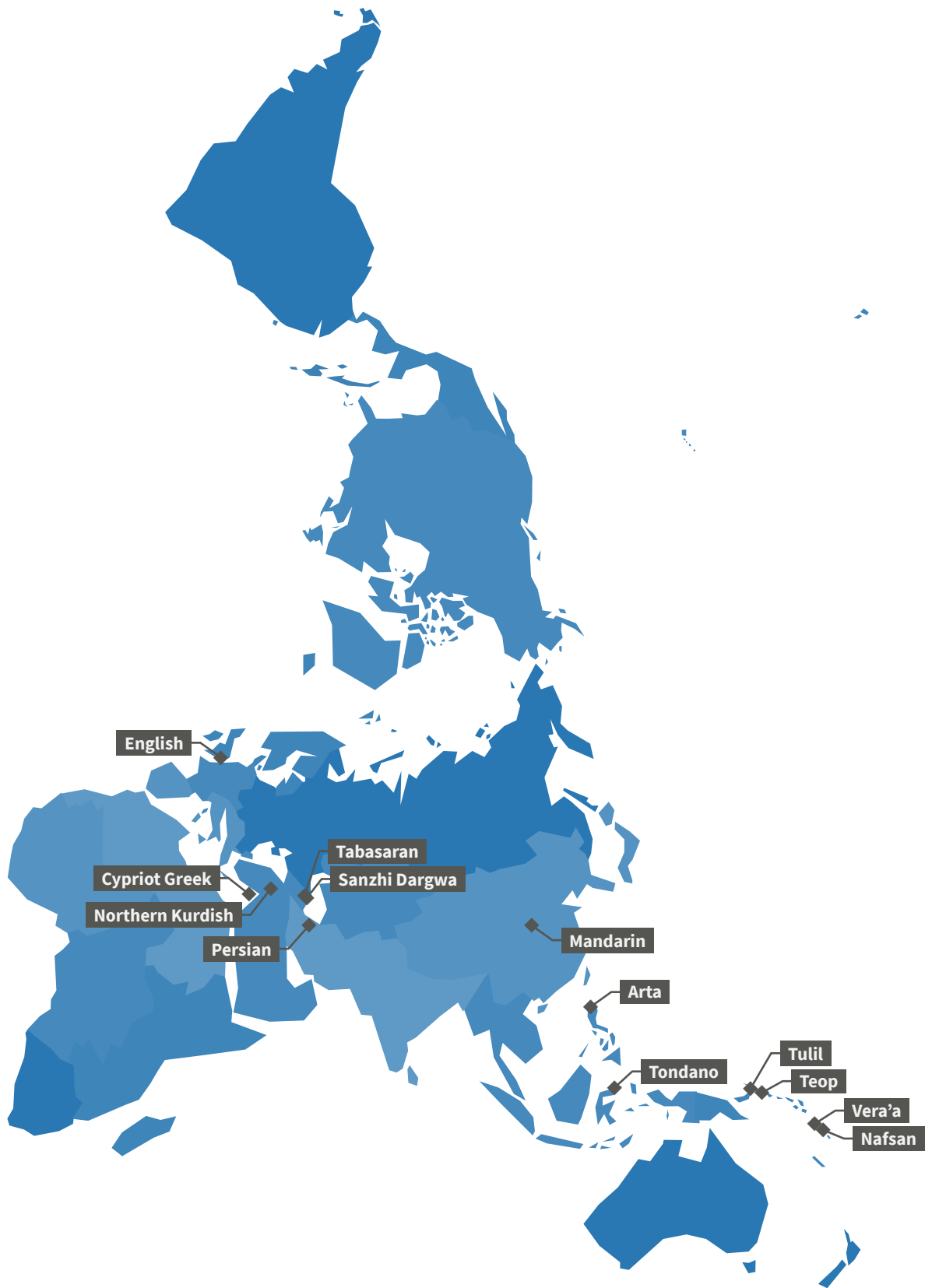
Figure 1 The Multi-CAST corpora.